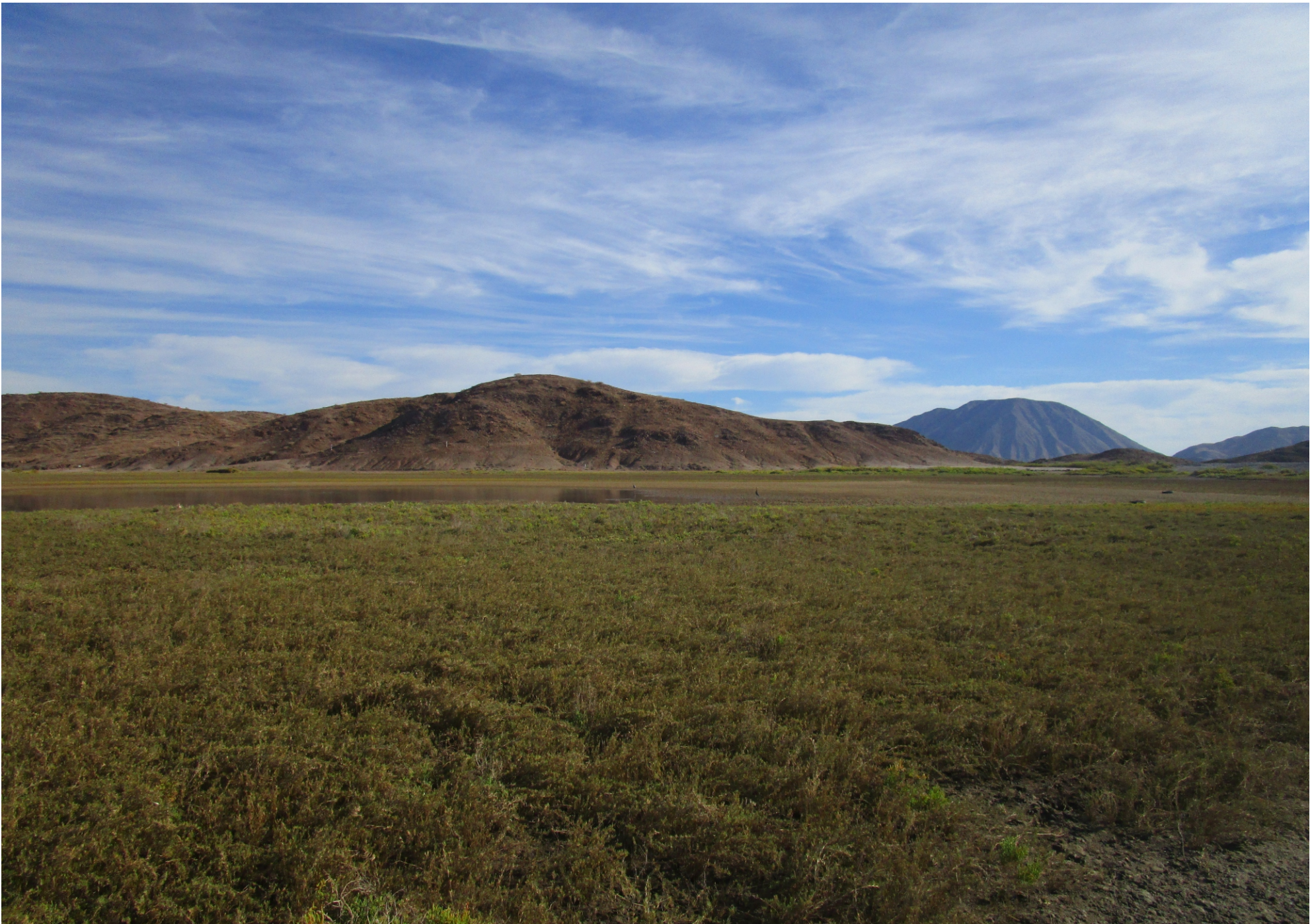
Club de Fotografía: Tiburones Dorados

In different locations around the Ramsar site, local fishermen practice commercial fishing and visitors can practice sport fishing, with the respective permits.