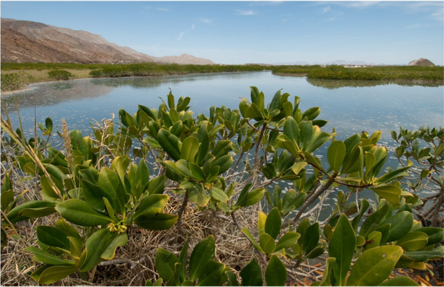
sitio Bahía de las Animas especie Mangrove Rojo / Red Mangrove / Rhizophora mangle